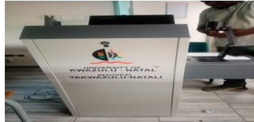
UKZN - PMB