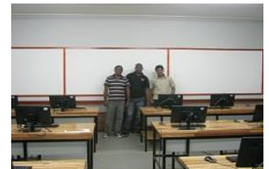
Mlonde High School