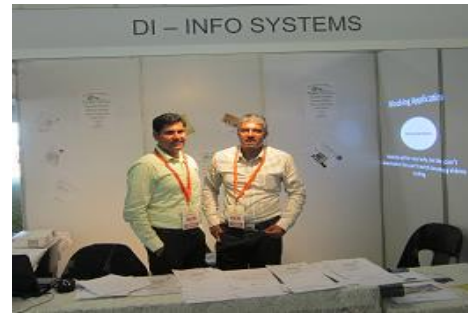
Future Leads Youth Economic Conference & Expo