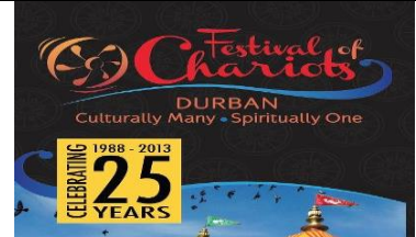
Hare Krishna Temple