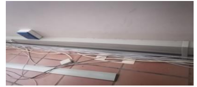
Mthashana tvet College