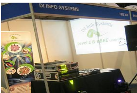
WASME (International Conference on Small & Medium Enterprises)