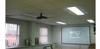
Department of Agriculture