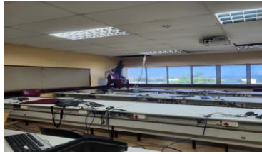
MUT- Network Maintainance