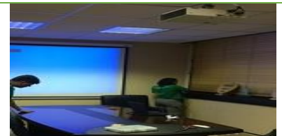
Office of the Premier