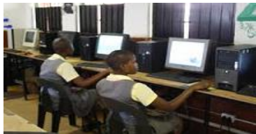
Department of Education