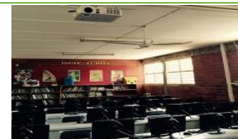
Mconjwana High School