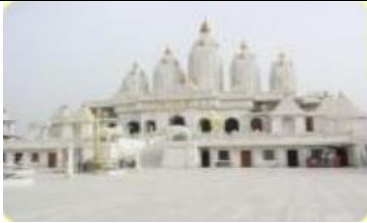
Shri Siddh Data Ashram