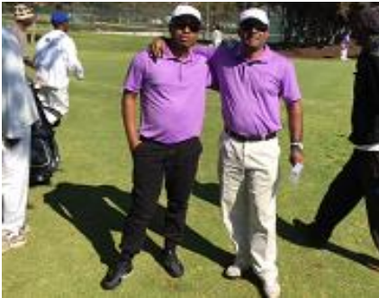
SITA Chairmen's Golf day