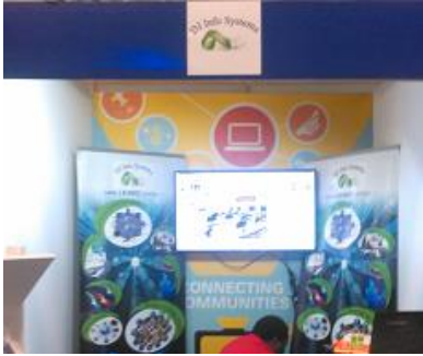
GovTech Government Technology Expo