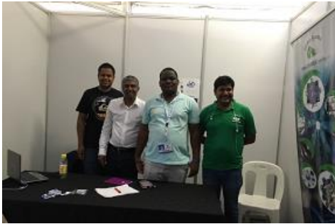
DBF Durban Business Fair