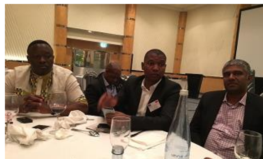
China South Africa Roundtable