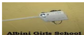
Albini Girls School