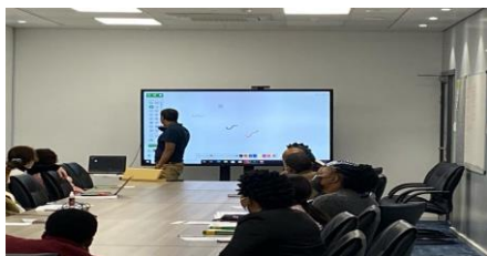
DOH-Director General Boardroom