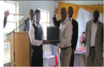
Mid-Illovo Ward awards