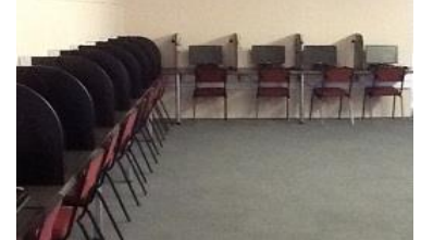
New Germany Primary School