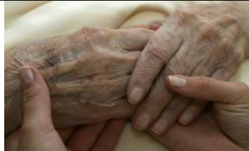
Durban Care For the Aged