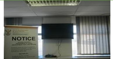
Department of Rural