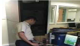
Department of Health