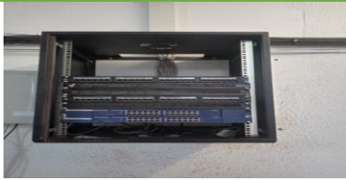
Durban icc - DEC Refurbish