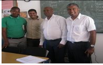
Cato Crest Primary School