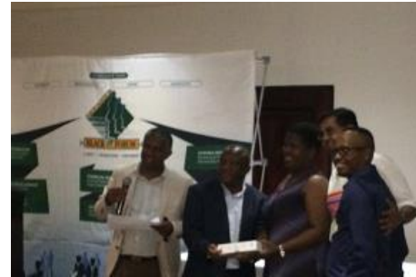
BITF Golf Day