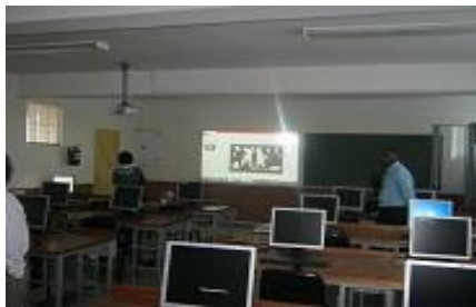
Uthando Primary School