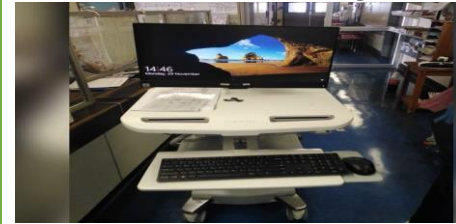
DOH – E-Health Project