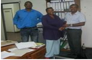
Wiggins High School