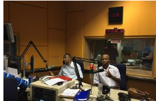
FM Lotus FM - SMME Development