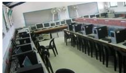
Mayville Secondary School