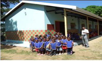
The Divine Life Society