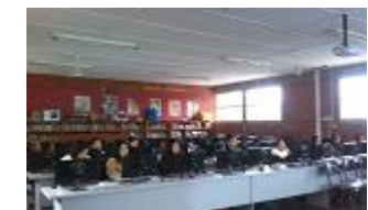
Permary Ridge Primary