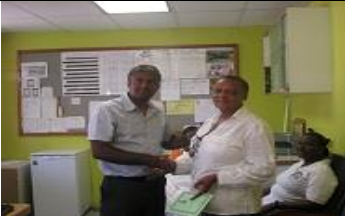
Nsimbini Primary School